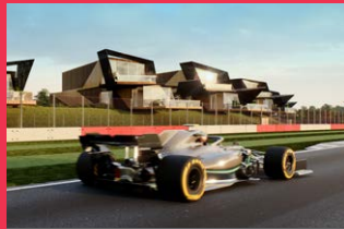
Escapade Silverstone Oxford England