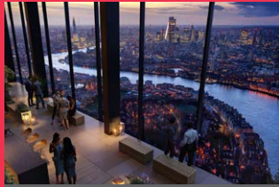
Landmark Pinnacle London E14