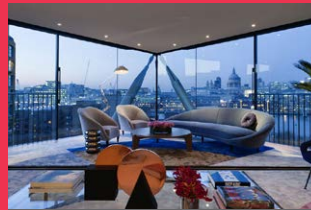
Neo Bankside London SE1