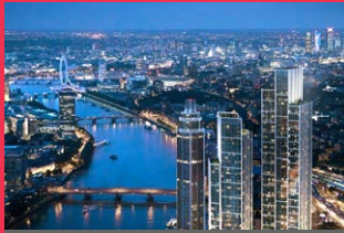
One Nine Elms London SW8