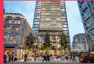
150 Bishopsgate London EC2