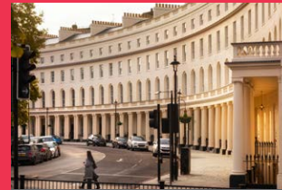
Regents Crescent London W1

Design consultation Project management Installation training Warranty and support