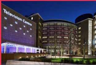
BBC Television Centre London W12