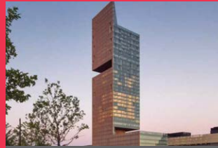
Manhattan Loft Gardens London E20