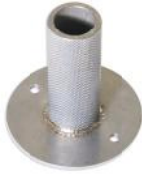
TBS-S600 Fixing spigot