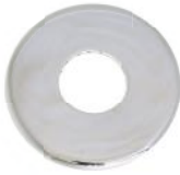
RDR-R-01 Retrofit dress ring (Sold separately) Ø70 x 5mm