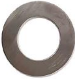
Stainless steel dress ring Ø42 x 2mm